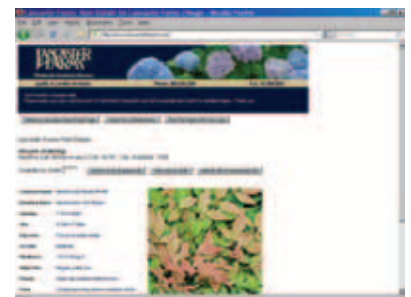
Growth information and plant photos.