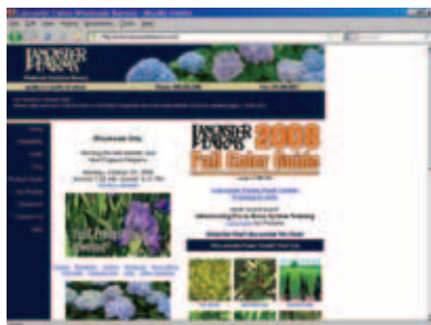
Easy sight navigation.

Visit our web site for complete pricing, updated plant availability and detailed plant information.