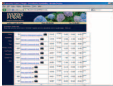
Updated availability and pricing.